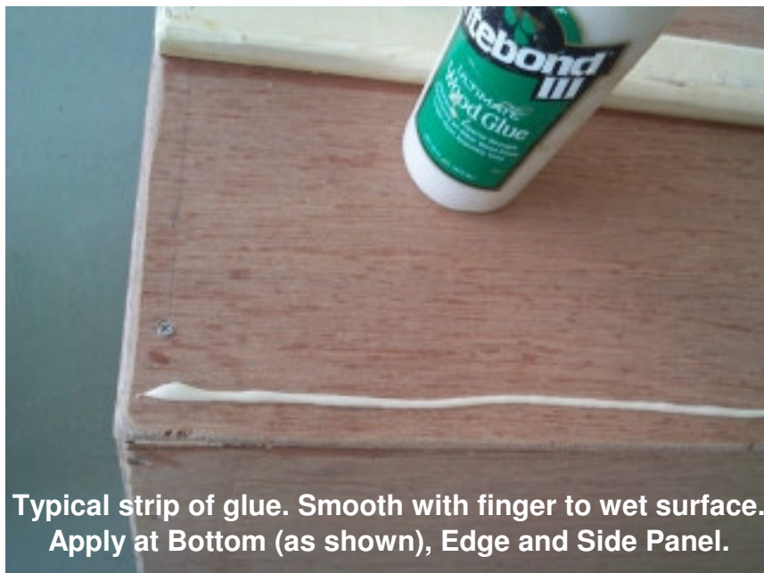
Typical strip of glue. Smooth with finger to wet surface. Apply at Bottom (as shown), Edge and Side Panel.