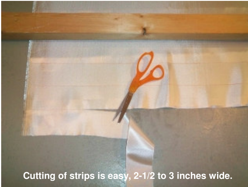
Cutting of strips is easy, 2-1/2 to 3 inches wide.