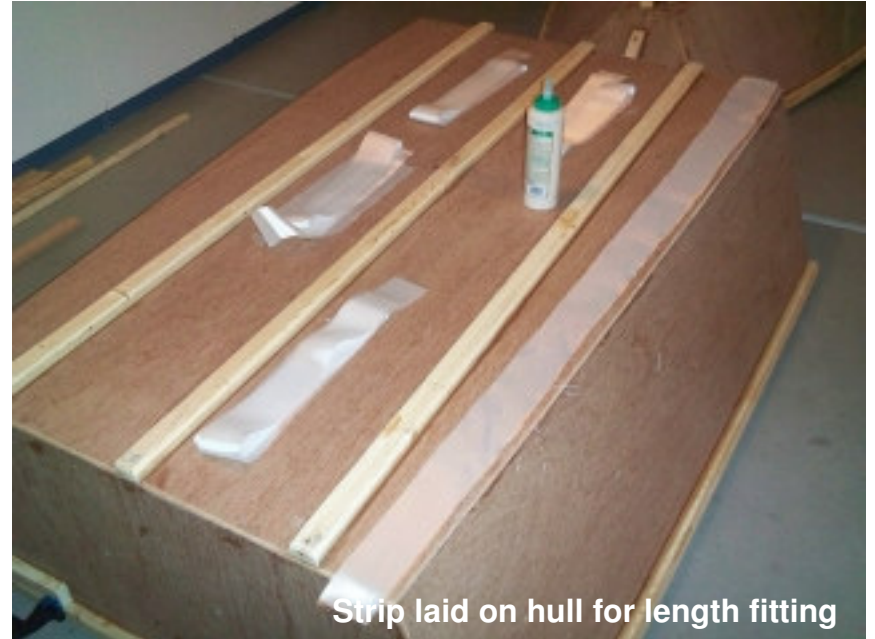
Strip laid on hull for length fitting