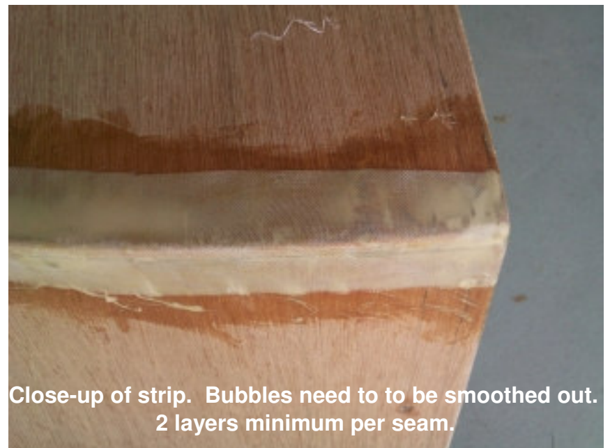
Close-up of strip. Bubbles need to to be smoothed out. 2 layers minimum per seam.