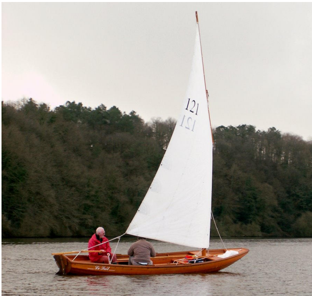
Timber built Seil by Canotage de France