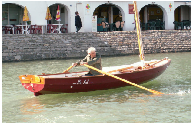
Plywood Seil (old version)

Seil is particularly easy to build in its wooden version, which has also the advantage of a greater lightness. Indeed, the planks (9 mm plywood) are very few and do not have any twist. They naturally take place on a building frame made up in particular of transverse bulkheads and both transoms.